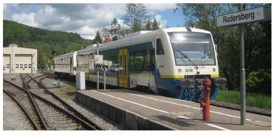
RS1 and NE 81 at the station Rudersberg

Consulting of the "Zweckverband" for the planned renewal of its Diesel fleet, on the non-electrified line of Wieslauftalbahn.