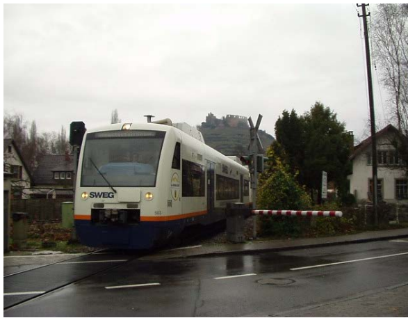
Motor car of type RS1on the Münstertalbahn in Staufen.

Feasibility of supply improvements including detailed cost accounting